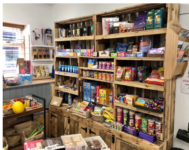
The original shelving unit, repositioned in the area previously used for the café.

Looking forward to seeing community group activities returning to the Village Hall.